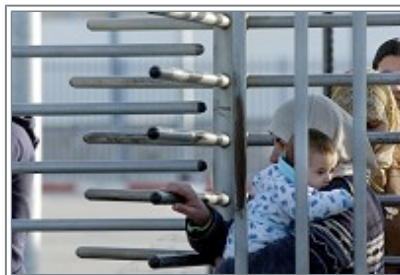
Crossing Qalandia on foot

BETHLEHEM - At around 12:30 am last night I was heading back to Bethlehem, by myself, from Ramallah as to avoid the early morning delay at the dreaded Qalandia terminal. At night there are very few cars , so I thought I'd take advantage and avoid the waiting and anxiousness to cross such a barrier causes. On some level, everyone must confront the mental and emotional anguish brought on by such confrontations.